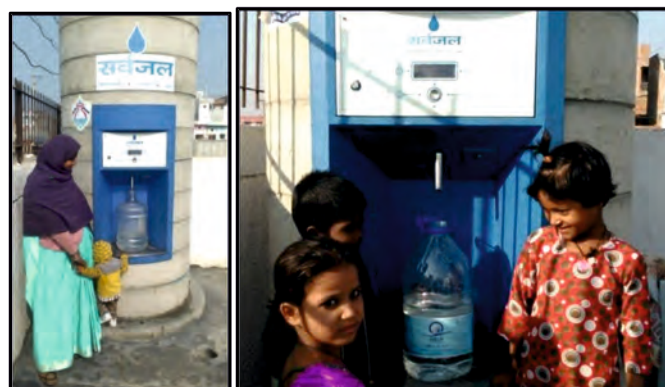
Pic. Consumers including children purchasing drinking water from the ATMs

Piramal Sarvajal has partnered with Delhi Jal Board for establishing India's first decentralized drinking water solution for urban slums in 8 relocation